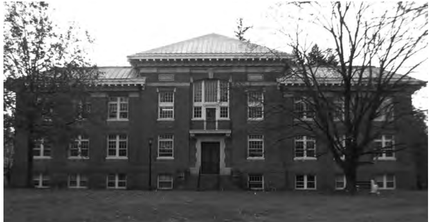
▲ Sanders Classroom Building at Vassar College in Poughkeepsie, New York. Copper Roof Replacement.

Washburn Shops Worcester, Massachusetts Cupola Restoration