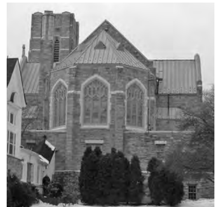
▲ Church of St. Augustine in Larchmont, New York. Copper Roof Restoration.

New York, New York Cupola and Eagle Restoration