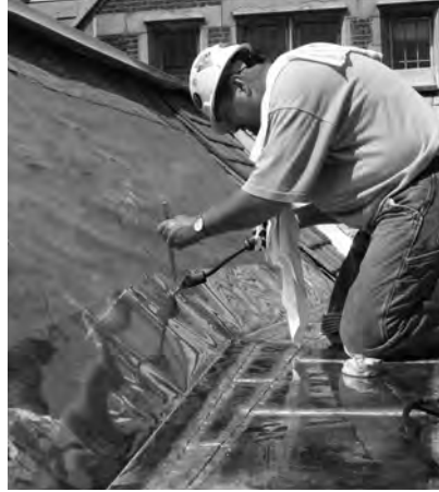
▲ Application of lead-tin solder to a flat-seam copper roof.

Solder is not the solution to all copper repair problems, however. Because the coefficient of expansion for lead-tin solder is different from that of copper, solder used to fill stress cracks will eventually break away. If cracking and metal fatigue are widespread, it may be time to consider roof replacement.