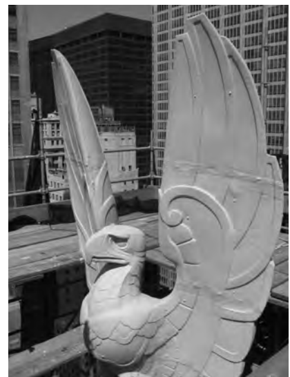
A Beyond roofing, copper is also used for ornamentation. Restoration of this copper eagle atop a 1929 high-rise involved off-site and on-site repair, cleaning, and reconstruction.