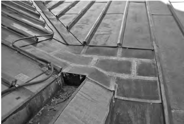
▲ Unusual conditions, such as this combination of soldered flat-seam roofing with steep-slope batten-seam, demand customized designs.

cold-rolled copper coated on both sides with lead, is used for roofing and flashings. Development of lead-coated copper was prompted by the desire for roofing and flashing material with the appearance and properties of lead, at a lower cost and with less weight. Lead-coated copper